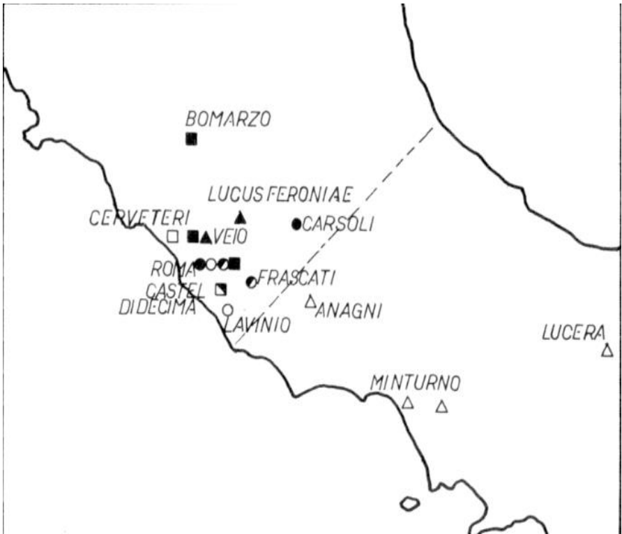
Figure. 4. Distribution of matrices, following certain regional/localized patterns (3 rd century B.C.) (Comella 1981, 792, fig. 9).