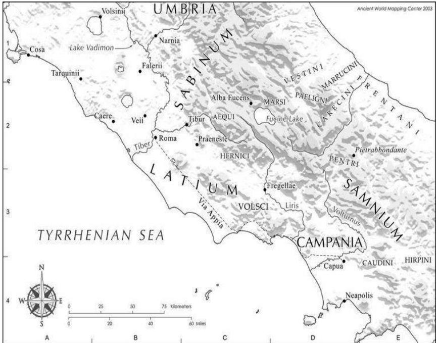
Figure 2. Map of Republican Italy

https://awmc.unc.edu/wordpress/free-maps/the-romans-from-village-to-empire-2nd-edition-2011/