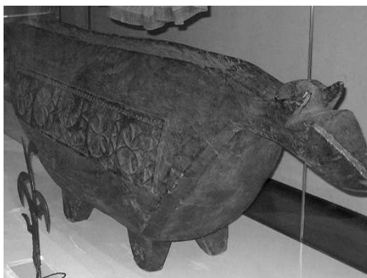
The Islamic Slit Drum (late 19 th c.)

From the British Museum with Ornaments Resembling the Bolnisi Cross