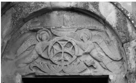
Elevation of the Cross by Angels Jvari (Cross) Monastery in Mtskheta, the 6 th century

We may come across similar cases in the history of art, culture and science, but they cannot be treated as the manifestation of heredity. Cross-shaped ornaments are widespread across different cultures. Christian art too frequently employs its stylized versions. This particular type of cross can be found in pre-Christian Georgia, while in the Christian period it even acquired a specific typological name 'Bolnisi Cross' and is more frequently represented in the scenes of the Elevation of the Cross by Angels.